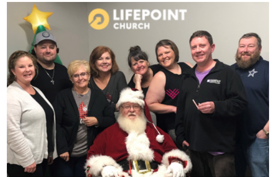
Foster Care East staff and families were treated to a Christmas party in Wilmington by LifePoint Church.